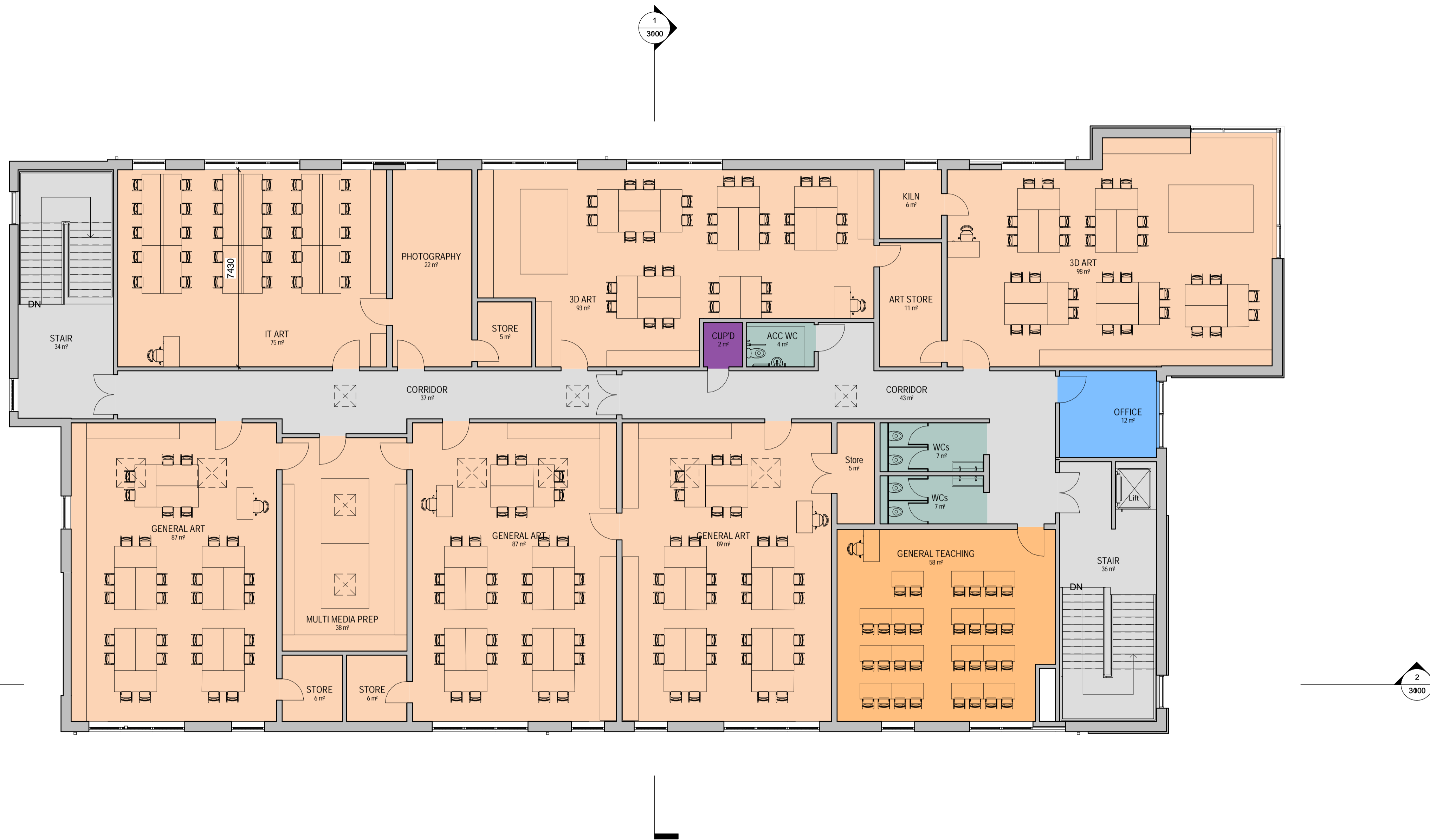
Second Floor GA Plan 1 : 100

Note: Do not scale this drawing. All levels and dimensions are to be checked on site. This drawing is to be read in conjunction with all relevant consultants' requirements, drawings and specifications. Any discrepancies between consultants' drawings to be reported to the Contract Administrator before any relevant work commences.